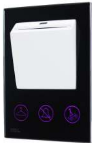
Figure 2. HDL-MPTC03.46