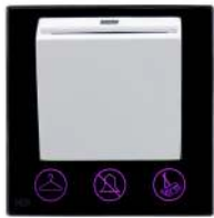
Figure 1. HDL-MPTC03.48