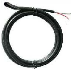
Figure 3. Temperature Sensor (TTS/APR1.0)