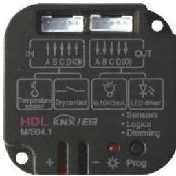
Figure 1. KNX 4-Zone Dry Contact Module

Datasheet Issued: June 17, 2019 File Edition: V1.0.0